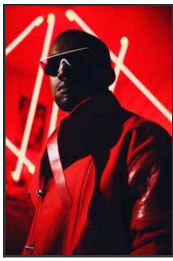
ISLAND DEF JAM MUSIC GROUP Kanye is ready to rock the house!

By Geoff Carter April 14, 2008 NWsource staff